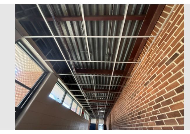
Description ACT frame install Area E